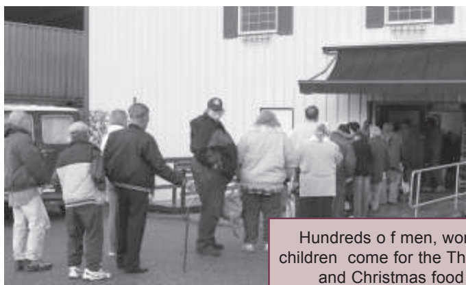
Hundreds of men, women, and children come for the Thanksgiving and Christmas food boxes

Fall brings so much beauty to us; the leaves change into warm and vibrant colors, as if they were giving us a final show before winter takes the stage. It is quite an amazing process and it is easy to appreciate the beauty, but much more difficult to live amongst it without shelter. As the leaves embark on their final display of the year, the winds pick up and temperatures drop. All traces of summer leave us until the next year rolls around.